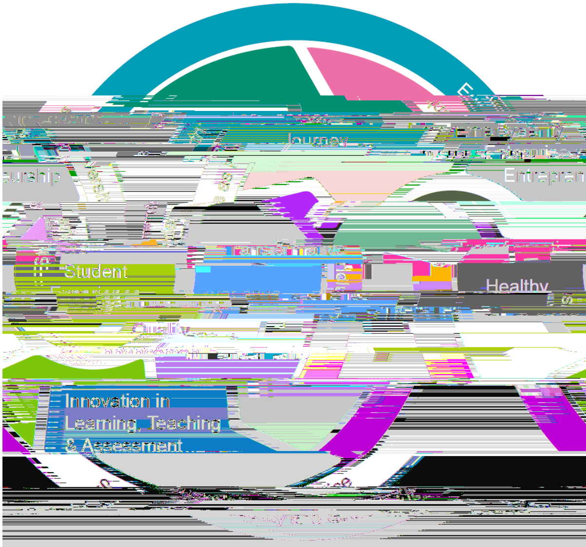
The QMU Student Experience Strategy 2021-26.

As the infographic shows, key areas of priority are presented under one of five action headings. These are supported by three overarching themes of Equality, Diversity and Inclusion; Students as Partners; and Sustainability and Social Justice that cut across the student experience during the period of Strategy. These themes are fundamental to the delivery of an outstanding student experience, and underpin all of our actions and activities